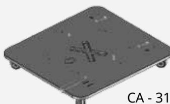
CA - 3100